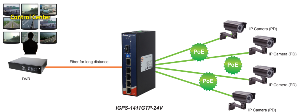
Connections of Ethernet devices

IGPS-1411GTP-24V can be used in connecting several PoE P.D. Ethernet devices like IP-Camera or other Ethernet devices. In addition, there are two different power inputs at terminal block to avoid interruption caused by power down. When the primary DC power input fails, the backup power input will take over immediately to guarantee a non-stop operation.